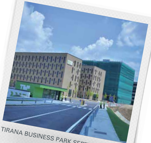
TIRANA BUSINESS PARK SEPTEMBER 2015