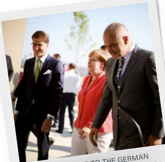
A WARM WELCOME TO THE GERMAN CHANCELLOR, DR. ANGELA MERKEL, TO TBP PREMISES IN TIRANA, ALBANIA

„The most important on such a big project are the people involved. Those who stand behind the project – whether as consultants, friends, representatives of politics and economics or as employees and partners.“