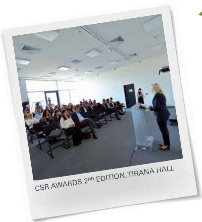
CSR AWARDS 2 ND EDITION, TIRANA HALL

TBP' retail area is located only on the ground floor, in a variety of shapes and sizes. The retail area is designed to accommodate coffee shops, restaurants, pharmacy, banks and ATM, fitness center, mini market, exchange etc., by keeping in mind that TBP is a city within a city.