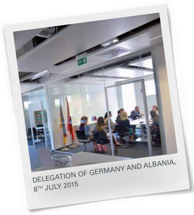
DELEGATION OF GERMANY AND ALBANIA, 8 TH JULY 2015

„A radiant example of understanding of free enterprise as an economic, social and urban contribution, an interaction bridge where will circulate not only money but also new ideas, a new knowledge, a new culture of cooperation and interaction in the new market.“