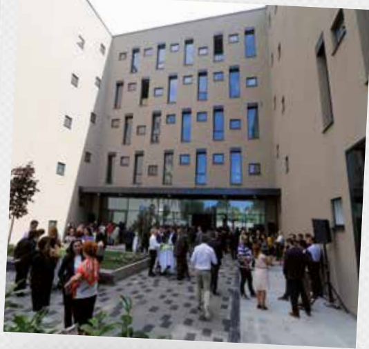
BUILDING 07 COURTYARD, VARIOUS PARTNERS AND CLIENTS

„It is also good that this `Tirana Business Park` exists. It is of the utmost importance and something like a lighthouse.“