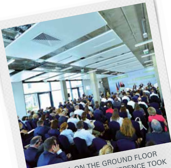
BERLIN HALL ON THE GROUND FLOOR OF TBP WHERE THE CONFERENCE TOOK PLACE