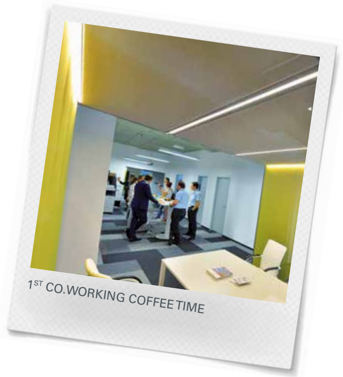
1 ST CO.WORKING COFFEE TIME

Tirana and Berlin Conference Halls located on the ground floor of Building 07 are distinctively designed for conference spaces. The halls can seat from 60-70 up to 350 people and are great for conferences, business meetings, presentations, symposiums, training sessions and classes.